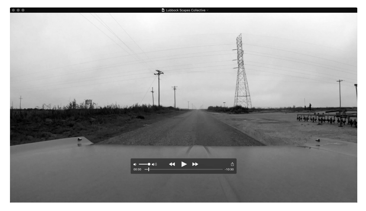
Figure 2: Lubbock Scapes Collective Manifesto video track at 0 minutes 30 seconds.