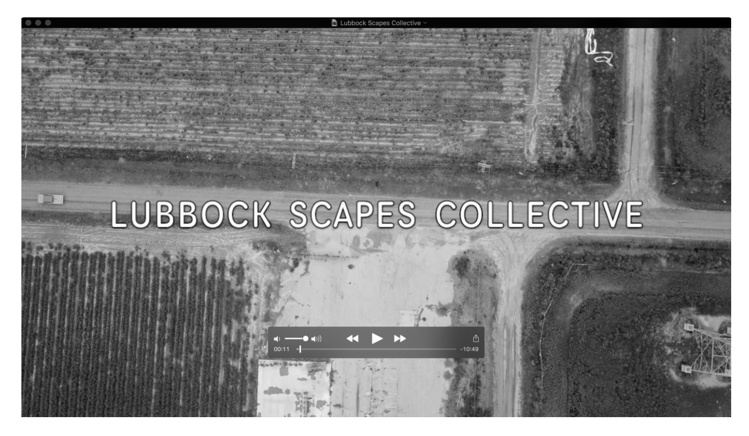
Figure 1: Lubbock Scapes Collective Manifesto video track at 0 minutes, 11 seconds.