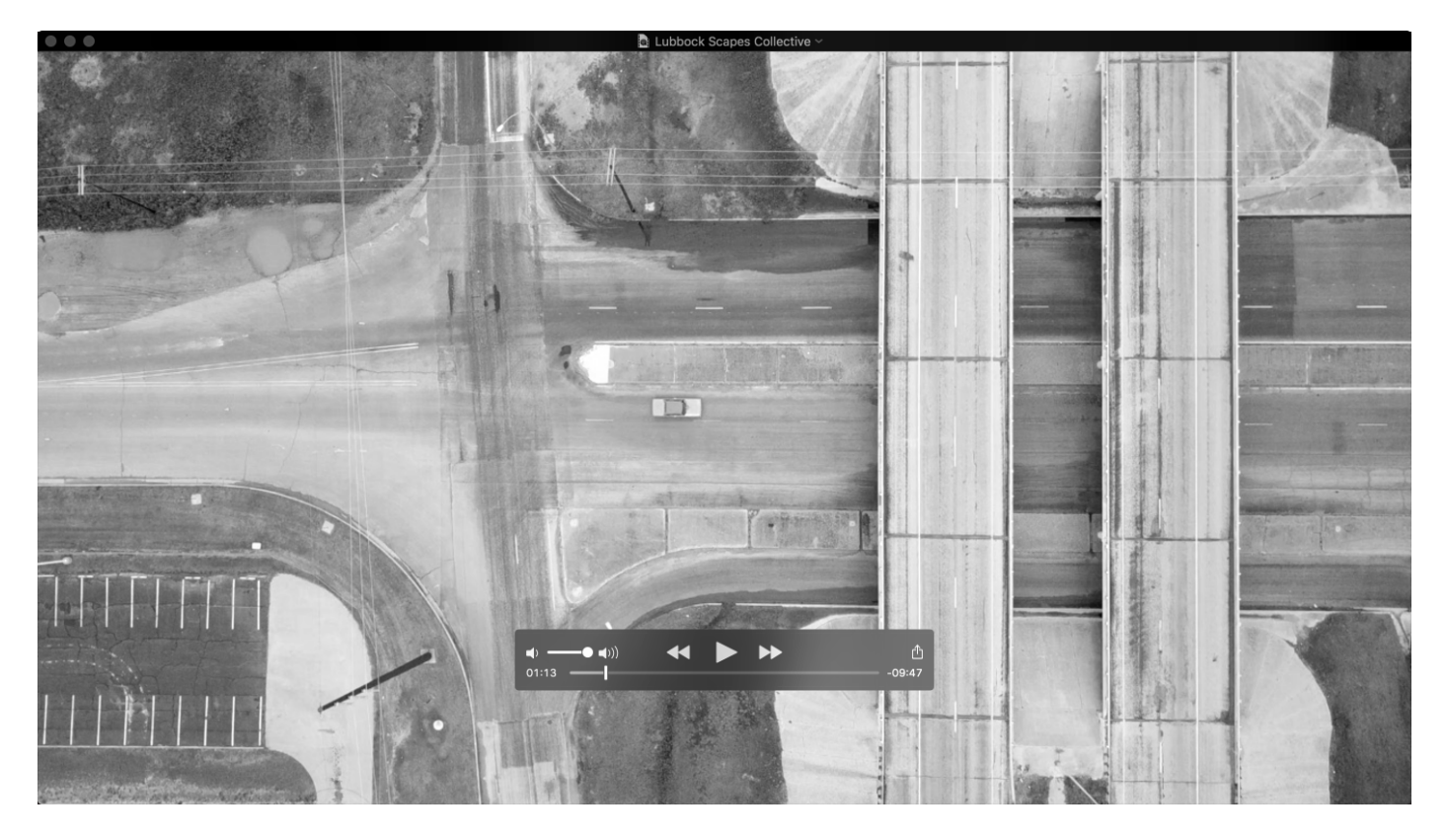
Figure 3: Lubbock Scapes Collective Manifesto video track at 1 minute 13 seconds.