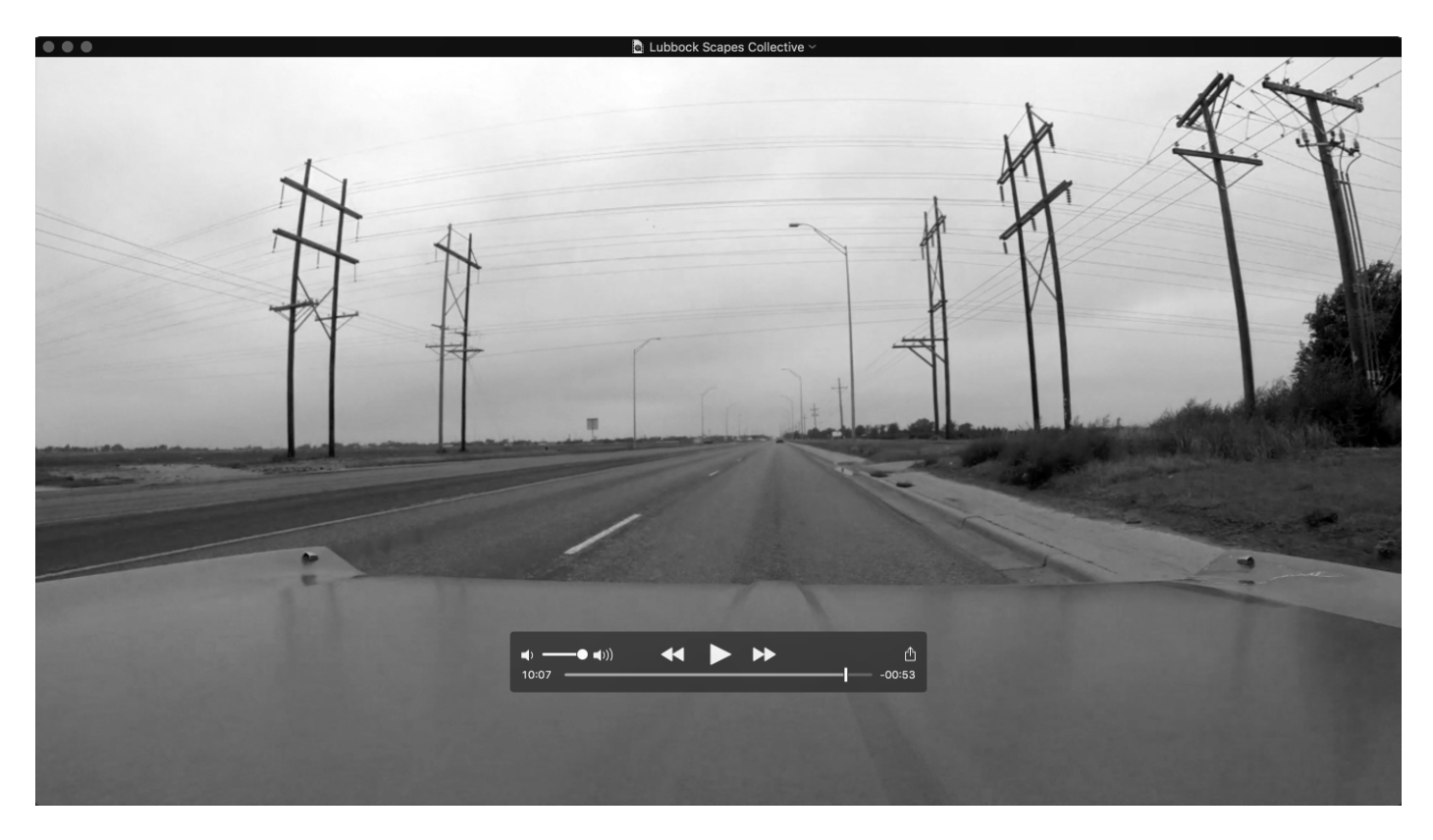
Figure 8: Lubbock Scapes Collective Manifesto video track at 10 minutes 7 seconds.

ago to the Anthropocene Llano. The twentieth-century horseman found no footprint of a short-faced bear on the dry bank of a Llano creek, but instead the pawprint of a feral dog. The great reservoir of silence suspended above the plain, through which birdsong, wind-washed grass, and thunder once flowed, outlining and intensifying the silence, today carries the ceaseless wheezing of the pump jack, the whump-whump whump of the wind charger, the hammer of diesels. The snowflake Appaloosa of a Comanche youth is now the blooded equine of suburban backyards. The crazy quilt of migrating shovelers and pintails overhead is now an invisible web of electromagnetic radiation, anchored to cell-phone towers like a monofilament net, and where open vistas once provoked an endless replication of possibility (or boredom for some), there are now fences and property lines for the once-upon-a-time hunter-gatherer to negotiate." Barry Lopez in Stephen Bogener and William Tydeman (eds). Llano Estacado: An Island in the Sky. Lubbock: Texas Tech University Press, 2011, p.3.