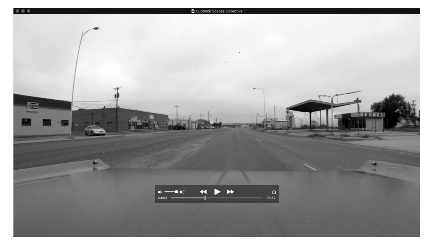
Figure 5: Lubbock Scapes Collective Manifesto video track at 4 minutes 3 seconds.

—We seek to understand, define, evaluate, and represent spaces people inhabit by using landscape as a structural model or framework to bring together a diverse group of disciplines