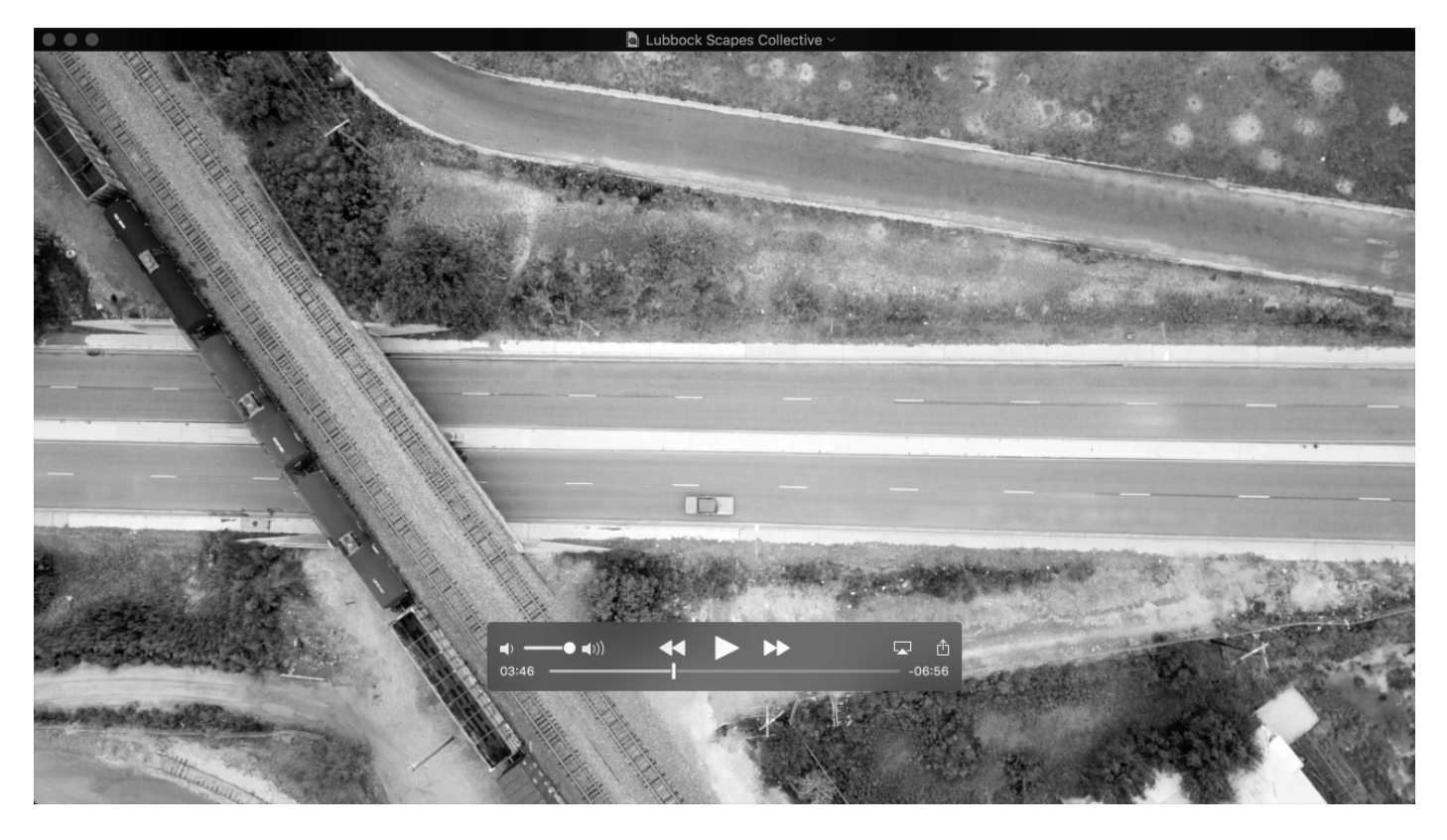
Figure 4: Lubbock Scapes Collective Manifesto video track at 3 minutes 46 seconds.