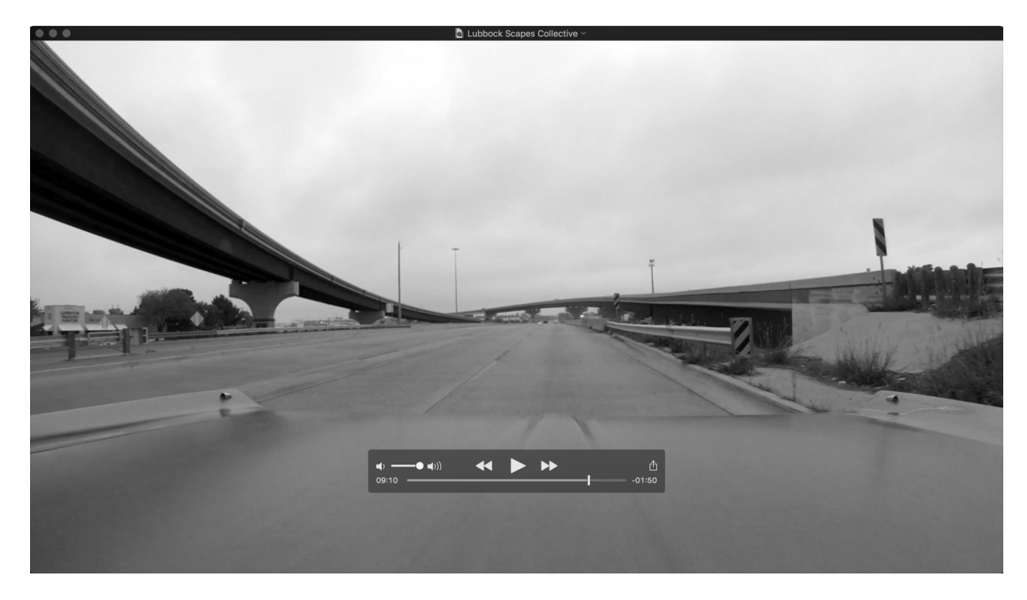
Figure 7: Lubbock Scapes Collective Manifesto video track at 9 minutes 10 seconds.

hills and flowers are considered as a scene. A decorative background that is static and functional. The history of the garden is profound and has come to represent different meanings. Today a big part of the urban, social and individual definitions of "land-scape" remain a form of frozen nature treated symbolically, plastically, or as if part of a museum. Notions that approach the idea of nature outside of the understanding of the forms of what is to come, outside of biotopes, ecosystems and vectors of time and inside the realm of the "object."