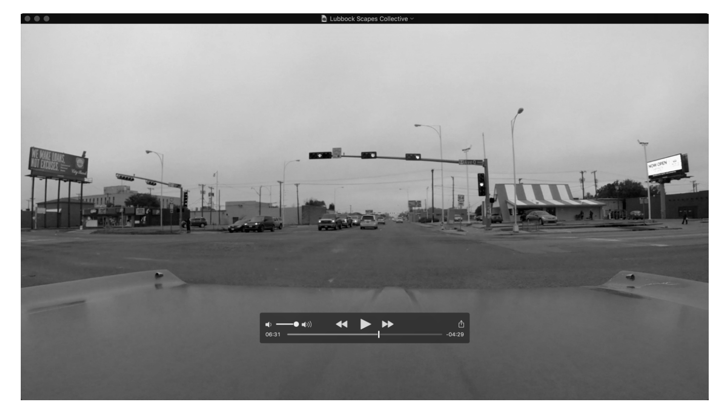
Figure 6: Lubbock Scapes Collective Manifesto video track at 6 minutes 31 seconds.